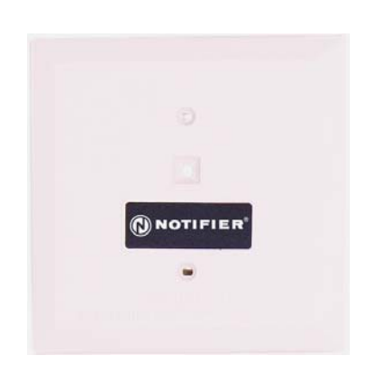
ISO-7-E Fault Isolator Module

If a wire-to-wire short occurs, the ISO-7-E will automatically open-circuit (disconnect) the SLC loop. After the short circuit condition is corrected, the ISO-7-E will automatically reconnect the isolated section of the SLC loop. The ISO-7-E will not require any addresssetting, and its operations totally automatic. The ISO-7-E can mount in a standard 4.0" (10.16cm) deep electrical box, in a surface-mounted backbox, or in the FACP.