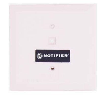
CMX-7C-E Intelligent Control Module

©2006 Honeywell International Inc. All rights reserved. Unauthorized use of this document is strictly prohibited.